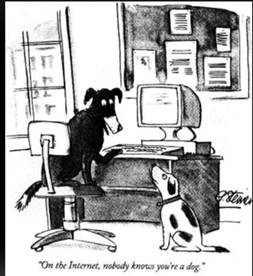
Image from The New Yorker cartoon by Peter Steiner, 1993.